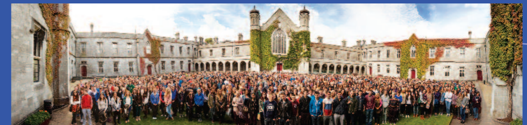
5.30pm Tuesday First Year Group Photo Shoot, The Quadrangle